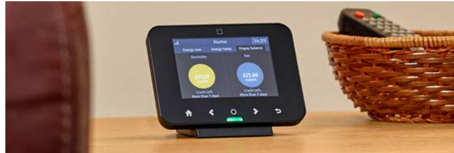
This image shows how a typical prepay in-home display looks. Prepay in-home display and figures are for illustrative purposes only.

If you have a prepay smart meter, you will receive the £400 grant from the Energy Bills Support Scheme automatically credited onto your smart meter.