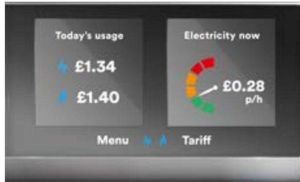
This image shows how a typical in-home display looks. In-home display and figures are for illustrative purposes only.

Smart meters can help you save energy, but it's not automatic. Many people find the in-home display useful. It allows you to have more information about your energy usage. This could help you work out how to save energy and money around the home. For example, by switching the TV off at the wall.